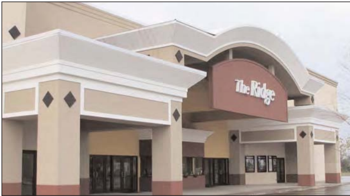
ICFs “deadend” sound: ICF’s concrete and foam are ideally suited for movie theatres.