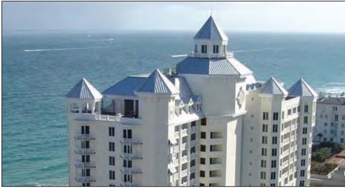
ICFs are versatile: From a one-story warehouse to high rise luxury buildings, ICFs fit the bill.