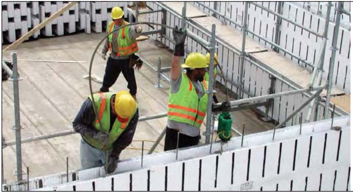
ICF components are lightweight: Forms go up faster and with fewer safety concerns as compared to other wall systems.