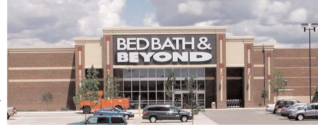
Only 1150 man hours were required to install 14,393 sq. ft. of ICF wall area enclosing this 30,400 sq. ft. building.

The concrete core in ICF walls resists damage from wind, fire, earthquakes, termites, rot, mold and mildew like no other wall system can. Not only are maintenance and insurance costs lowered, but risks to life and threats to business continuity are greatly diminished, so ICF-built structures hold their value for generations.